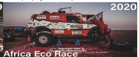
Africa Eco Race